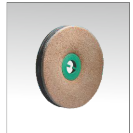
Pad holder available as option