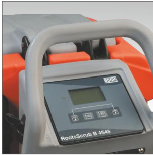
Ergonomic handle for operators of any height. Excellent view of the area to be cleaned. Soft touch buttons for selection of operation. LCD panel with display of hour meter, battery level.