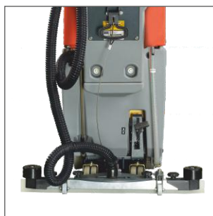
Professional self levelling Squeegee Ensuring Excellent performance