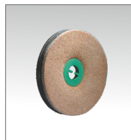
Pad holder available as option