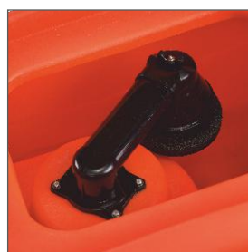
Easy tank cleaning, thanks to the large tank opening. Tank can be emptied quickly and easily via the large outlet hose. Overflow protection for the dirty water tank.