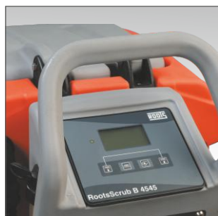
Ergonomic handle for operators of any height. Excellent view of the area to be cleaned. Soft touch buttons for selection of operation. LCD panel with display of hour meter, battery level.