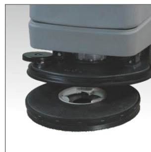
Brushes can be changed quickly without the need for any tools at the push of a button.