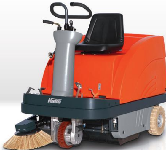
Sweepmaster B900 R