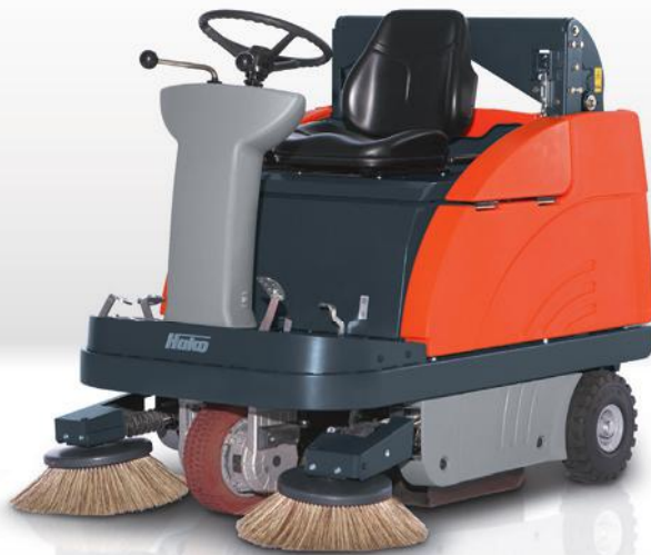
Sweepmaster B980 RH